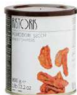
TOMATOES DRIED 6 x 800g RIST02