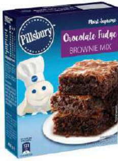
PILLSBURY MIX BROWNIE CHOC 6 x 415g PB05