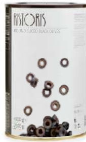
OLIVES SLICED BLACK 3 x 4.1kg RIST126