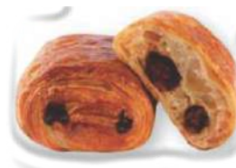
PAIN AU CHOCOLAT 70 x 70g S2256