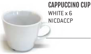
CAPPUCCINO CUP WHITE x 6 NICDACC