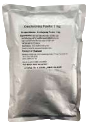
GOCHUJANG PASTE 10 x 1kg GOCH001