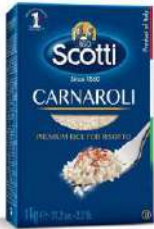
RISO SCOTTI RICE CARNAROLI 10 x 1kg SC007