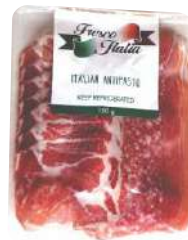
ITALIAN ANTIPASTO SELECTION 12 x 150g BER74