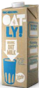
OATLY OAT DRINK ORGANIC 6 x 1L OAT581