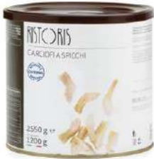
ARTICHOKE QUARTERS 6 x 2.5kg RIST05