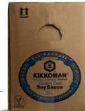
KIKKOMAN TAMARI GLUTEN FREE SOYA SAUCE 1 x 20L KKE130