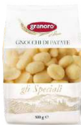
GRANORO GNOCCHI OF POTATO 12 x 500g GR05GNO