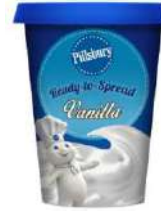
PILLSBURY ICING VANILLA 8 x 400g PB04