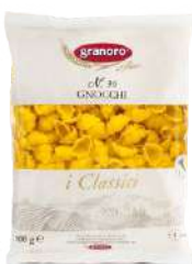
GNOCCHI 24 x 500g G039GNO