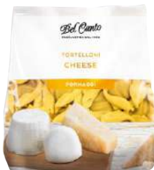
4 CHEESES TORTELLONI 10 x 500g BERT23