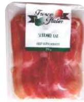
SERRANO HAM 12 x 70g NOE09