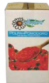
CHOPPED TOMATO BAG IN BOX 1 x 10kg ROD07