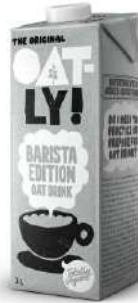
OATLY OAT DRINK BARISTA EDITION 6 x 1L OAT164