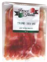
EMILIANO CURED HAM 12 x 70g VIL04