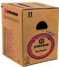
SOYA SAUCE BIB 1 x 20L KKE160