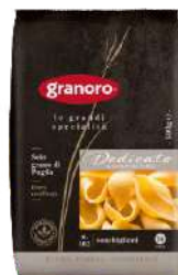
DEDICATO CONCHIGLIONI 12 x 500g G102DED