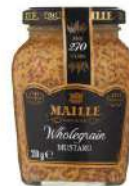
MAILLE MUSTARD WHOLE GRAIN 6 x 210ml MAI050