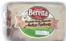
PROSCIUTTO CRUDO BRICK FOR SLICING +/-5kg BER22