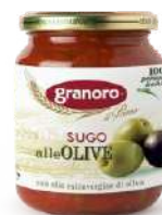
OLIVE PASTA SAUCE 6 x 370g GRA0LO01