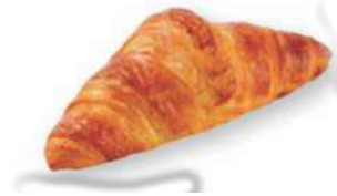
BUTTER CROISSANT 80 x 55g S848