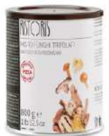
MUSHROOMS SAUTEED 6 x 800g RIST007