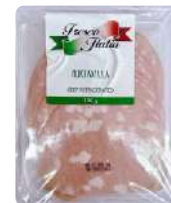
MORTADELLA 12 x 100g BER851