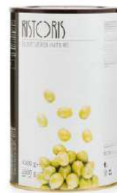
OLIVES WHOLE GREEN 3 x 4.1kg RIST128