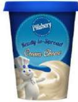
PILLSBURY ICING CREAM CHEESE STYLE 8 x 400g PB02