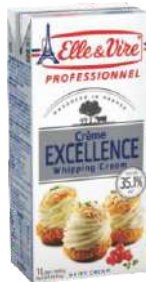
EXCELLENCE WHIPPING CREAM 35,1% FAT 12 x 1L ELVIR22