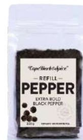
BLACK PEPPER DOY REFILL 6 x 200g CAP107