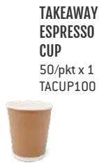
TAKEAWAY ESPRESSO CUP 50/pkt x 1 TACUP100