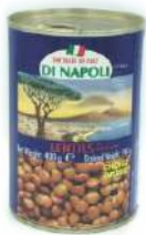
LENTILS 24 x 400g LBS12