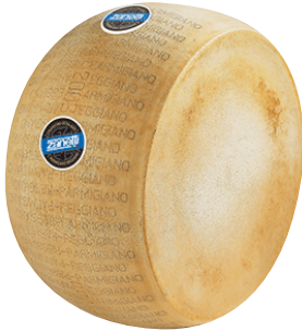
PARMIGIANO REGGIANO WHEEL 1 x +/-35kg ZAN01