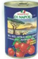
DI NAPOLI CHERRY TOMATOES 12 x 400g LBS16