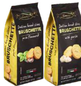
Laurieri Bruschette GARLIC 15 x 150g LAU020