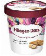
HÄAGEN-DAZS MACADAMIA NUT BRITTLE 8 x 460ml HD03