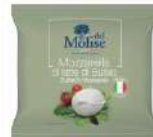
BUFALO MOZZARELLA 20 x 125g DAL004