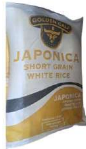
SUNRISE JAPONICA RICE 1 x 25kg JAP001