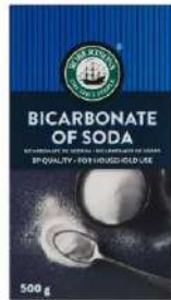
BICARBONATE OF SODA 4 x 10 x 500g RB003