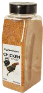
SWEET & STICKY CHICKEN SHAKER 6 x 830g CAP192