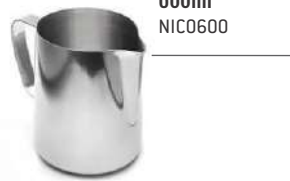
STAINLESS STEEL FROTHING JUG 600ml NIC0600