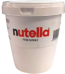
NUTELLA SPREAD 2 x 3kg FEN3KG