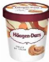
HÄAGEN-DAZS DULCE DE LECHE CARAMEL 8 x 460ml HD05