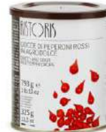
RED PEPPER DROPS SWEET & SOUR 6 x 793g RIST651