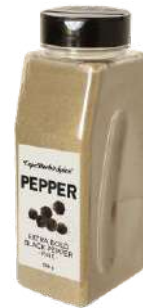
BLACK PEPPER FINE SHAKER 6 x 550g CAP196