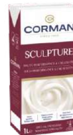
CORMAN SCULPTURE CREAM 12 x 1L CORM003