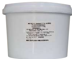
DANISH WHITE FETA CHEESE 1 x 3.2kg KIRK02