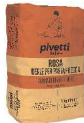
MP PASTA FRESCA ROSA FLOUR 1 x 5kg MOLI166