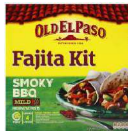
OLD EL PASO KIT FAJITA BBQ 6 x 500g OEP10