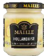
MAILLE HOLLANDAISE 6 x 185g MAI027