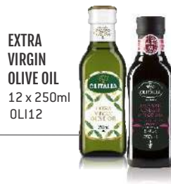
EXTRA VIRGIN OLIVE OIL 12 x 250ml OLI12