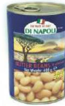
BUTTER BEANS 24 x 400g LBS10