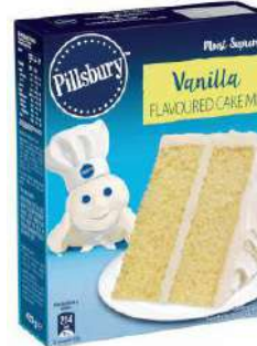
PILLSBURY MIX VANILLA 6 x 425g PB08