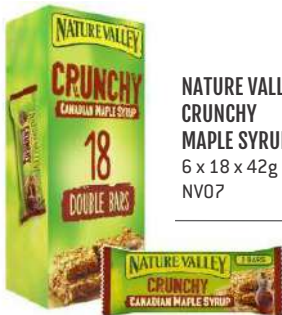
NATURE VALLEY CRUNCHY MAPLE SYRUP 6 x 18 x 42g NV07