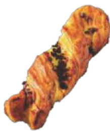
CHOCOLATE CHIP TWIST 60 x 100g S1973