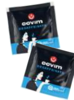
DECAF COFFEE PAPER POD 25 Pods NIC4033