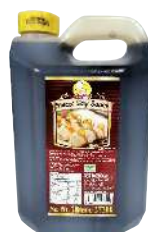
SUREE SAUCE SOYA SWEET 6 x 2L SUR006