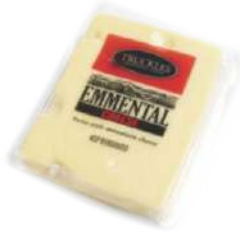
EMMENTAL 1 x +/-200g TRUC59