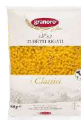
TUBETTI RIGATI 24 x 500g G1062