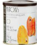
PEPPERS GRILLED 6 x 800g RIST049