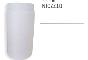
DETERGENT 900g NICZZ10