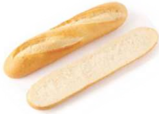
PANECILLO 29cm 72 x 120g S645