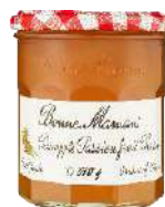
PINEAPPLE & PASSION FRUIT JAM 6 x 370g WOOL2402