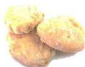
BEYOND MEAT TEMPURA BITES PLANT-BASED FROZEN 40 x 20g BEY007