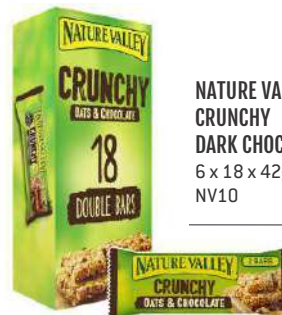
NATURE VALLEY CRUNCHY DARK CHOCOLATE 6 x 18 x 42g NV10