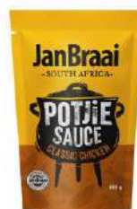
CLASSIC CHICKEN POTJIE SAUCE 10 x 400g JB08