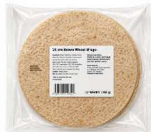
TONY WHOLE WHEAT WRAP 25cm 12 x 10 TONY98