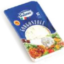
GORGONZOLA WEDGE 12 x 200g ZAN102