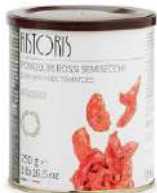
TOMATOES SEMI-DRIED 6 x 750g RIST514