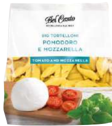
TOMATO & MOZZARELLA TORTELLONI 10 x 500g BERT22