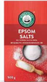
EPSOM SALTS 4 x 10 x 500g RB011