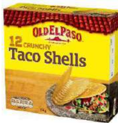
OLD EL PASO TACO SHELLS 8 x 156g OEP05