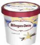
HÄAGEN-DAZS VANILLA & CREAM 24 x 100ml HD12