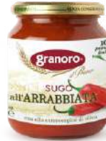
ARRABBIATA PASTA SAUCE 6 x 370g GR02ARR