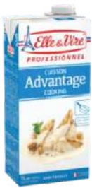
ADVANTAGE LIGHT COOKING CREAM 6 x 1L ELVIR02