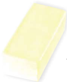
MOZZARELLA 1 x +/-2.5kg PARM16