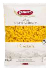
FAGIOLINI RIGATI 24 x 500g G1050