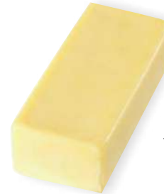
CHEDDAR 1 x +/-2.5kg PARM02