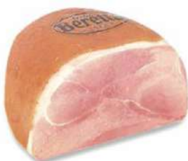
PROSCIUTTO COTTO/ COOKED HAM +/-7.8kg BER04