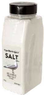
SEA SALT (IODATED) SHAKER 6 x 1 000g CAP197