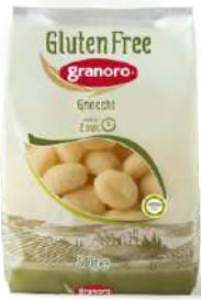
GLUTEN FREE GNOCCHI 12 x 500g GR471GGNO