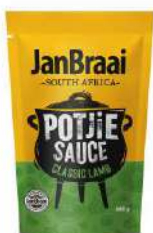
CLASSIC LAMB POTJIE SAUCE 10 x 400g JB07