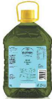
POMACE OLIVE OIL PET 2 x 5L OLI09