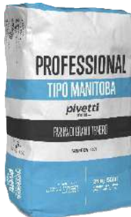
MP TIPO 0 MANITOBA FLOUR 1 x 25kg MOLI068