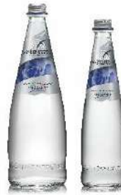
WATER SPARKLING MINERAL GLASS 12 x 750ml BEN11