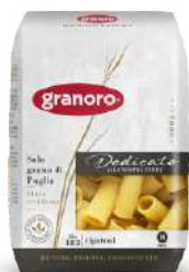
DEDICATO RIGATONI 20 x 500g G183DED