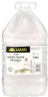
SAFARI WHITE SPIRIT VINEGAR 5% 2 x 5L CECIL031