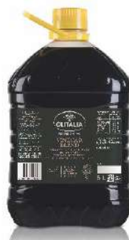
BLACK CONDIMENT WITH BALSAMIC 2 x 5L OLI44