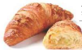
BUTTER ALMOND CROISSANT 48 x 90g S9072