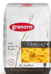
DEDICATO FARFALLONI 20 x 500g G079DED