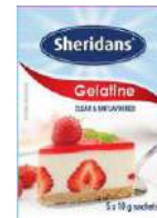
SHERIDANS GELATINE 12 x 50g RB020