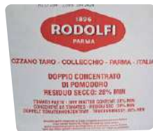
RODOLFI TOMATO PASTE DOUBLE CONCENTRATE 1 x 20kg ROD002