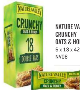
NATURE VALLEY CRUNCHY OATS & HONEY 6 x 18 x 42g NV08