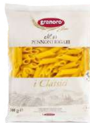
PENNONI RIGATI 24 x 500g G043PEN