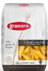
DEDICATO PENNONI RIGATI 20 x 500g G190DED