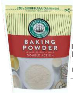
BAKING POWDER DOUBLE ACTION 12 x 1kg RB002