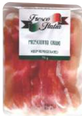
PROSCIUTTO CRUDO 12 x 70g VIL52