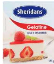
ROBERTSONS GELATINE 1 x 125g RB2481