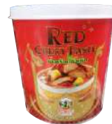
PANTHAI RED CURRY PASTE 12 x 1kg PANT01