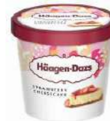
HÄAGEN-DAZS STRAWBERRY CHEESECAKE 24 x 100ml HD14