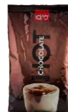
CIRO HOT CHOCOLATE 12 x 500g CIR01