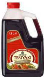
TERIYAKI SAUCE 4 x 1.9L KKE071