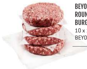
BEYOND MEAT ROUNDS BEEF-STYLE BURGER 10 x 113g BEY006