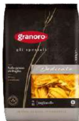
DEDICATO TAGLIATELLE NEST 12 x 500g G184DED