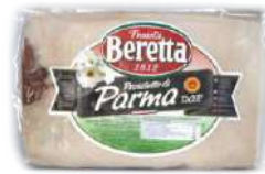
PROSCIUTTO DI PARMA BRICK FOR SLICING +/-5kg BER21