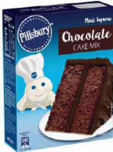
PILLSBURY MIX CHOCOLATE 6 x 425g PB07