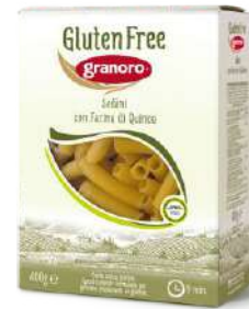
GLUTEN FREE SEDANI 12 x 400g GR476GSED