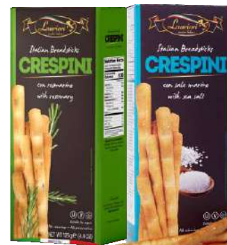
Laurieri Crespini ROSEMARY 14 x 125g LAU011