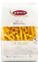
SEDANINI 24 x 500g G024SED