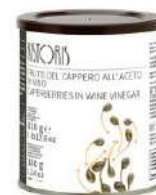
RIST CAPER BERRIES IN VINEGAR TIN 6 x 810g RIST526