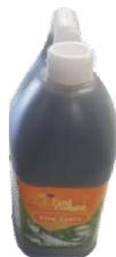
FISH THAI DELIGHT SAUCE 4 x 4.5L TD075