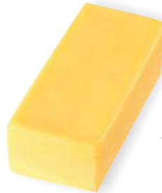
GOUDA 1 x +/-2.5kg PARM01