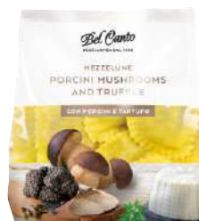
PORCINI MUSHROOMS & TRUFFLE MEZZELUNE 10 x 500g BERT24