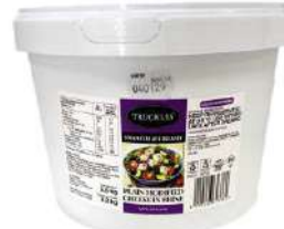
TRUCKLES DANISH STYLE FETA CHEESE 1 x 3.2kg FAIRO08