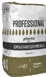
MP RE-MILLED DURAM WHEAT SEMOLINA 1 x 25kg MOLI193