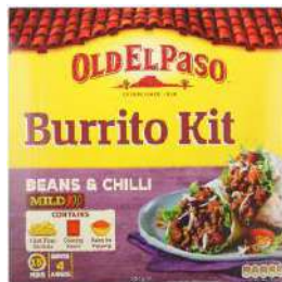
OLD EL PASO KIT BURRITO 6 x 260g OEP09