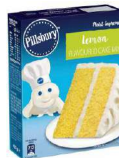
PILLSBURY MIX LEMON 6 x 425g PB11