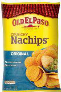
OLD EL PASO NACHO CHIPS 10 x 185g OEP01