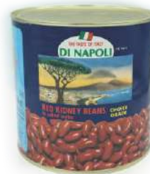
RED KIDNEY BEANS 6 x 2.6kg LBS18