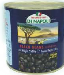
BLACK BEANS 6 x 2.6kg LBS24