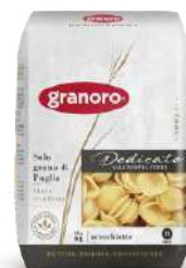
DEDICATO ORECCHIETTE 20 x 500g G084DED