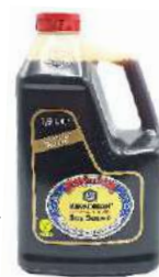
SOYA SAUCE GI REGULAR 6 x 1.9L KKE571