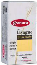
EGG FREE LASAGNA 12 x 500g G105LAS