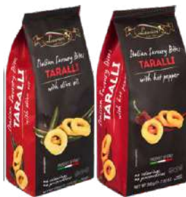
Laurieri Taralli HOT PEPPER 15 x 200g LAU007