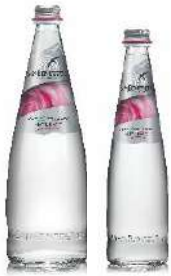
WATER STILL MINERAL GLASS 12 x 750ml BEN12