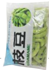
EDAMAME-BEAN FROZEN IN SHELL 20 x 454g JF511