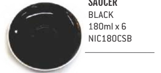
CAPPUCCINO SAUCER BLACK 180ml x 6 NIC180CSB