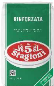
PIZZA FLOUR GREEN 1 x 25kg AGUG05