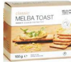
MELBA TOAST 12 x 100g MELO1