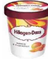
HÄAGEN-DAZS MANGO RASPBERRY 8 x 460ml HD09