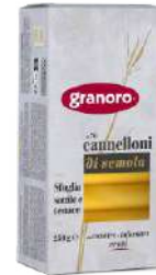
CANNELLONI 24 x 250g G076CAN