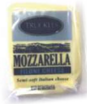
MOZZARELLA 1 x +/-200g PARM08