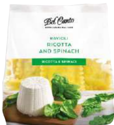
RICOTTA & SPINACH RAVIOLI 10 x 500g BERT20