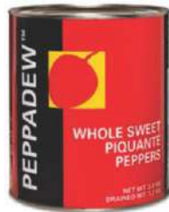
PEPPADEWS MILD 6 x 3kg PEP001