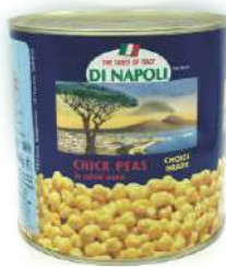
CHICK PEAS 6 x 2.6kg LBS19