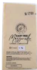
VEGAN MOZZARELLA 1 x 1kg VEG14