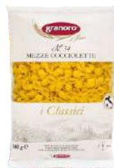
MEZZE COCCIOLETTE 24 x 500g G054COC