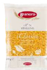
STELLINE 24 x 500g G1074