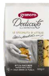
DEDICATO PACCHERI 12 x 500g G136DED