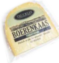
BOERENKAAS TRADITIONAL 1 x +/-200g TRUC54