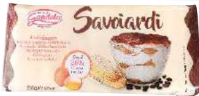
LADY FINGER / SAVOIARDI 30 x 200g SWE05