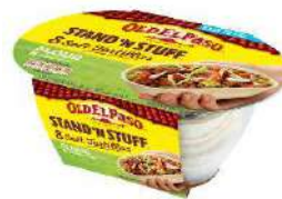
OLD EL PASO STAND 'N STUFF SOFT TORTILLA 4 x 193g OEP06