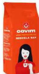
MISCELA BAR BEANS 6 x 1kg NIC2707