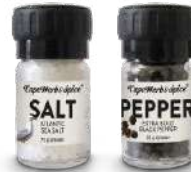
MINI TWINSET GRINDER 6 x 110g CAP104