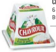
CHAVROUX 6 x 150g BON02

... that is still being fulfilled to this day. All around the world, ILE DE FRANCE® offers products of unique quality, with a wide range of selected, carefully chosen imported French cheeses, helping you discover gourmet food, expert knowledge and the French way of life. ILE DE FRANCE® imported French cheeses worthy of your special moments!