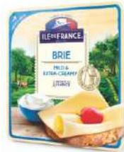
SLICED BRIE 8 x 150g BON6992