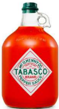
RED PEPPER SAUCE GALLON 1 x 3.8L TAB529