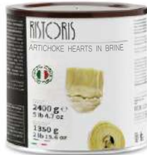
ARTICHOKE HEARTS 6 x 2.4kg RIST04