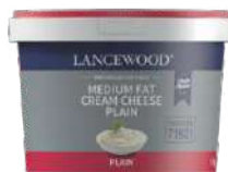
BULK CREAM CHEESE 2.5kg LAN71911