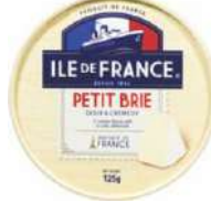
BRIE 12 x 125g BON4201