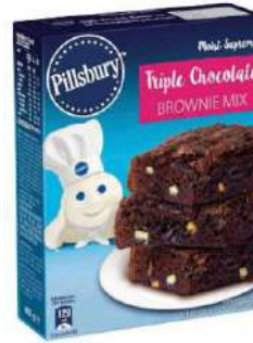
PILLSBURY MIX TRIPLE BROWNIE 6 x 415g PB06