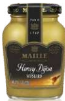
MAILLE HONEY MUSTARD 6 x 185g MAI506