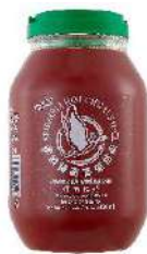
SRIRACHA HOT CHILLI 4 x 3450ml WWTJ203