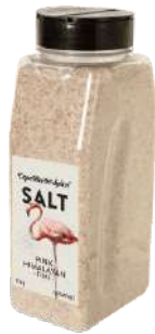
PINK SALT (IODATED) SHAKER 6 x 1 000g CAP191