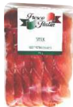
SPECK 12 x 70g ADL02