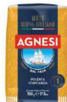
POLENTA 24 x 500g POL01