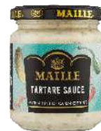
MAILLE TARTARE SAUCE 6 x 185g MAI029