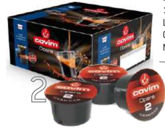
OPERA GRAN BAR DOUBLE ESPRESSO 100 Capsules LAVAZZA BLUE COMPATIBLE NIC45111