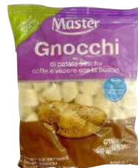
MASTER GNOCCHI OF POTATO PLAIN FROZEN 6 x 500g GNOC1