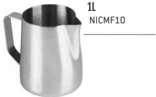
STAINLESS STEEL FROTHING JUG 1L NICMF10