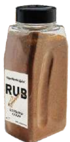
LOUISIANA CAJUN SHAKER 6 x 640g CAP193