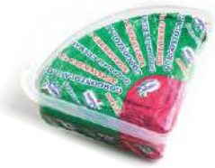
GORGONZOLA WEDGE 1 x 1.5kg ZAN104