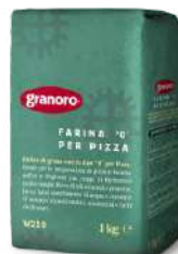
GRANORO 0 PIZZA FLOUR 10 x 1kg GRAPIZ01