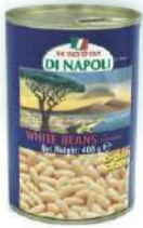
CANNELLINI BEANS 24 x 400g LBS07