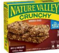
NATURE VALLEY CRUNCHY OATS CHOCOLATE 12 x 5 x 42g NV03