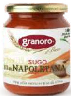
NAPOLETANA PASTA SAUCE 6 x 370g GR03NAP