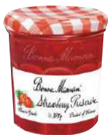
STRAWBERRY JAM 6 x 370g WOOL292