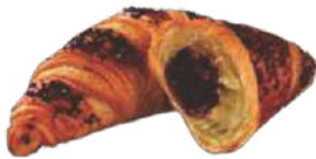
CHOCOLATE & HAZELNUT CROISSANT 60 x 70g S6898