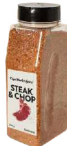
STEAK & CHOPS SHAKER 6 x 720g CAP199