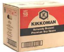
SOYA SAUCE GMO FREE 1 x 18L JS150GMF