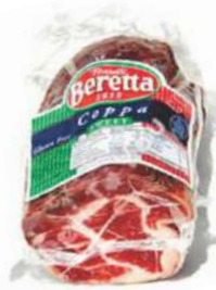
COPPA RUSTICA FOR SLICING +/-4.5kg BER13