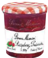
RASPBERRY JAM 6 x 370g WOOL295