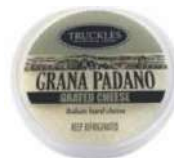
GRATED GRANA PADANO 12 x 60g WOOL30