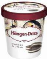
HÄAGEN-DAZS COOKIES & CREAM 8 x 460ml HD04