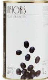
OLIVES WHOLE BLACK 3 x 4.1kg RIST135