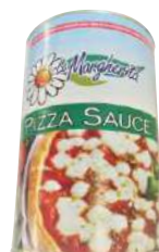
PIZZA SAUCE 3 x 4.1 kg STER04