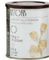
LONG STEM ARTICHOKE 6 x 750g RIST03