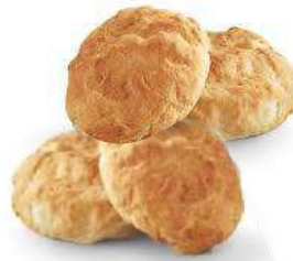
GLUTEN FREE HAMBURGER ROLLS 100g TONY28