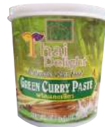
GREEN CURRY PASTE T/DELIGHT 6 x 1kg TD003