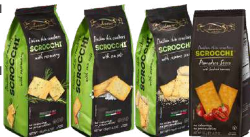
Laurieri Scrocchi SESAME SEEDS 15 x 175g LAU003