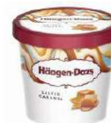
HÄAGEN-DAZS SALTED CARAMEL 24 x 100ml HD17