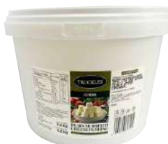
TRUCKLES DANISH STYLE FETA CHEESE (CUBED) 1 x 3,2kg FAIRO09