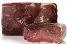
BULK NO ADDED NITRITE SERRANO FOR SLICING +/-5kg NOE29