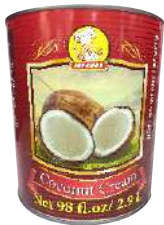
SUREE COCONUT CREAM 6 x 2.9L SUR005