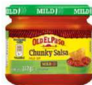
OLD EL PASO DIP SALSA CHUNKY MILD 6 x 312g OEP14