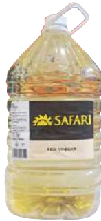
SAFARI RICE VINEGAR 5% (KOSHER) 2 x 5L CECIL026