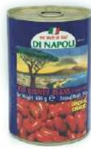
RED KIDNEY BEANS 24 x 400g LBS13