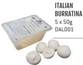
ITALIAN BURRATINA 5 x 50g DAL001

Thanks to the long-term experience in the food sector, the consortium Dal Molise is specialised in the production of both fresh and frozen dairy products in order to face the requests from the foreign markets. Cow's milk or DOP buffalo's milk mozzarella, mascarpone, ricotta and burrata are only some of their items. Focused on quality, tradition and innovation, the consortium offers a wide range of further goods such as truffle products.