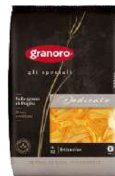
DEDICATO FETTUCINE NEST 12 x 500g G082FET