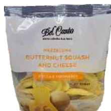
BUTTERNUT SQUASH & CHEESE MEZZELUNE 1 x 500g BERT001