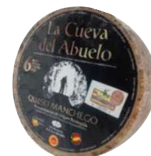
MANCHEGO CHEESE 1 x 3kg SPAN1001