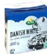
DANISH WHITE FETA CHEESE 24 x 500g KIRK04