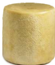
PECORINO ROMANO WHEEL 1 x +/-25kg ZAN79