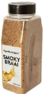
SMOKEY BRAAI SHAKER 6 x 690g CAP200