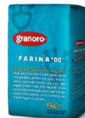
GRANORO 00 FARINA 10 x 1kg G000TIP