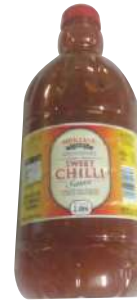
SWEET CHILLI SAUCE 6 x 2L MONTO1