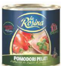
LA ROSSINA TOMATO WHOLE PEELED 6 x 2.5kg LBS28