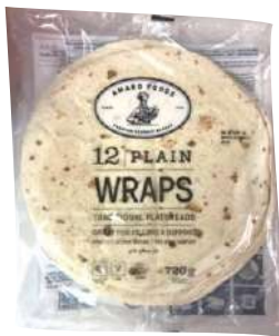
PLAIN WRAP 25cm 12 x 10 TONY15