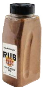
SMOKEHOUSE BBQ SHAKER 6 x 840g CAP198