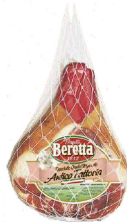
PROSCIUTTO CRUDO DEBONED ANTICA FATTORIA +/- 6kg BER61