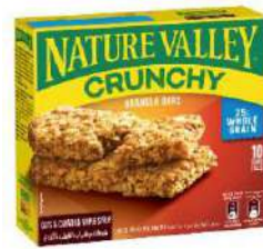
NATURE VALLEY CRUNCHY OATS MAPLE SYRUP 12 x 5 x 42g NV05