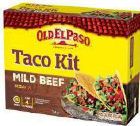
OLD EL PASO KIT BEEF TACO MILD 8 x 380g OEP07