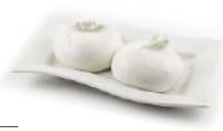
ITALIAN BURRATA 2 x 125g DAL002