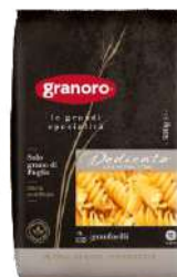
DEDICATO GRANFUSILLI 12 x 500g G135DED