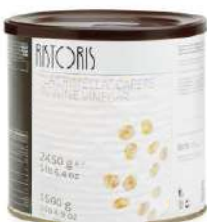
CAPERS IN VINEGAR TIN 6 x 2.450kg RIST509