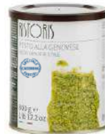
BASIL PESTO 6 x 800g RIST000