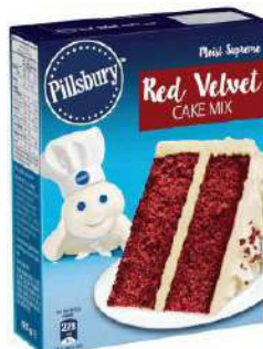
PILLSBURY MIX RED VELVET 6 x 425g PB10