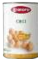
GRANORO CHICK PEAS 24 x 500g G680