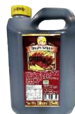
SUREE SAUCE HOISIN 6 x 2L SUR011