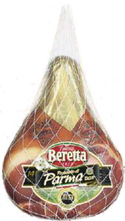
PROSCIUTTO DI PARMA DEBONED +/-6.5kg BER01