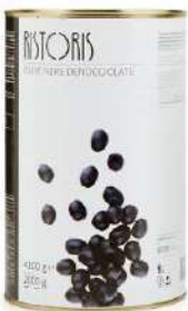
OLIVES PITTED BLACK 3 x 4.1kg RIST149