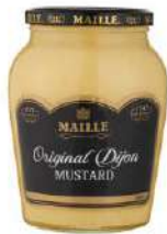
MAILLE MUSTARD DIJON 6 x 800ml MAI015

The House of Maille was established in the Age of Enlightenment. The official creation of the Maison Maille is authenticated by a parchment dating from 1747. Maille continues to present refinement, allowing the world to experience part of the French way of life. The chefs at Maille recognise that nothing is more difficult to prepare than a sauce.