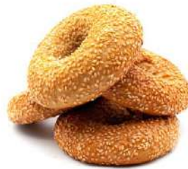
SESAME SEED 50 x 100g TONY26