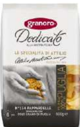
DEDICATO PAPPARDELLE 12 x 500g G134DED