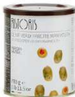
OLIVES STUFFED 6 x 780g RIST01