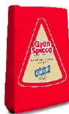
ITALIAN HARD CHEESE WEDGE 1 x 1kg ZAN62