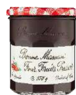
FOUR FRUITS JAM 6 x 370g WOOL2401