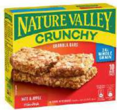
NATURE VALLEY CRUNCHY OATS APPLE CRISP 12 x 5 x 42g NV04