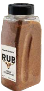
TEXAN STEAKHOUSE SHAKER 6 x 760g CAP194