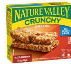
NATURE VALLEY CRUNCHY OATS CINNAMON 12 x 5 x 42g NV06