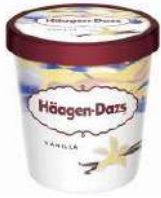
HÄAGEN-DAZS VANILLA 8 x 460ml HD01