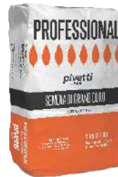
MP DURAM WHEAT SEMOLINA 1 x 5kg MOLI198