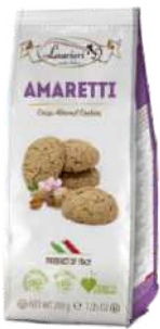
Laurieri Amaretti ALMOND 15 x 200g LAU019