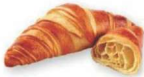
BUTTER CROISSANT 80 x 90g S3101