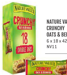
NATURE VALLEY CRUNCHY OATS & BERRIES 6 x 18 x 42g NV11