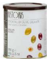
GIANT OLIVES COCKTAIL 6 x 780g RIST521