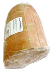
MORTADELLA +/-5kg BER855