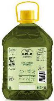
EXTRA VIRGIN OLIVE OIL 2 x 5L OLI08