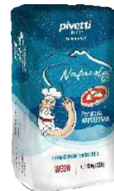
MP NEAPOLITAN PIZZA FLOUR 1 x 10kg MOLI139