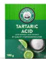
TARTARIC ACID 24 x 100g RB012