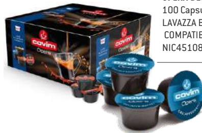
OPERA DECAF 100 Capsules LAVAZZA BLUE COMPATIBLE NIC45108