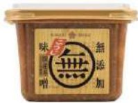
HIKARI MISO 8 x 375g WOOL2238