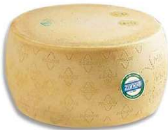
GRANA PADANO WHEEL 1 x +/-35kg ZAN03