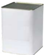
DANISH WHITE FETA CHEESE 1 x 16kg KIRK01