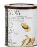
ZUCCHINI GRILLED SLICES 6 x 780g RIST070