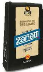
PARMIGIANO REGGIANO WEDGE 1 x 1kg ZAN107