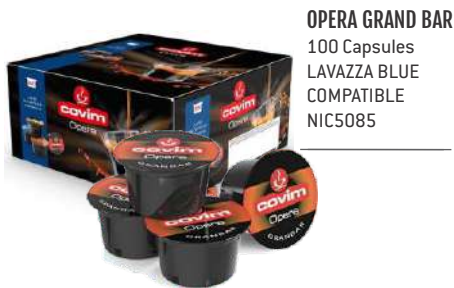
OPERA GRAND BAR 100 Capsules LAVAZZA BLUE COMPATIBLE NIC5085