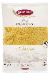
ROSMARINO 24 x 500g G069ROS