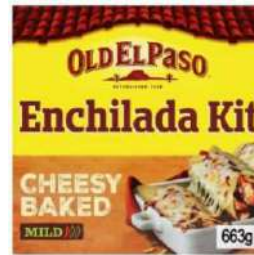
OLD EL PASO KIT ENCHILADA 6 x 663g OEP08