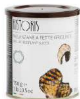
EGGPLANT SLICES GRILLED 6 x 750g RIST035