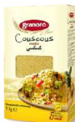
COUS COUS 10 x 1kg COU03