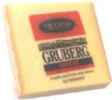
GRUBERG 1 x +/-220g TRUC53