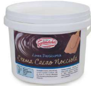
CHOCOLATE PASTE 1 x 2.9kg GAN02