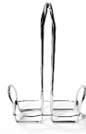
EMPTY CADDIES OLI25