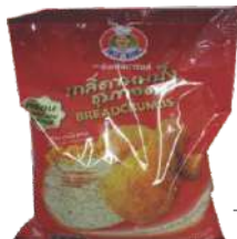
BREADCRUMBS 10 x 1kg RBF001