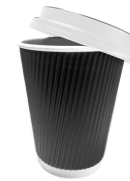
TAKEAWAY CAPPUCCINO CUP 350ml 50/pkt TACUP350 LID (WHITE) 50/pkt TALID350