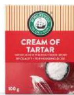
CREAM OF TARTAR 4 x 6 x 100g RB010