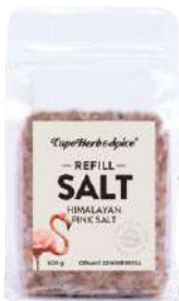
PINK SALT DOY REFILL 6 x 500g CAP106