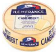
CAMEMBERT 12 x 125g BON4101