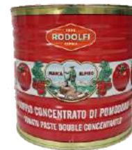
RODOLFI TOMATO PASTE 6 x 3kg ROD001