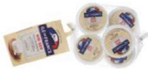
MINI BRIE 12 x (5 x 25g) BON4401