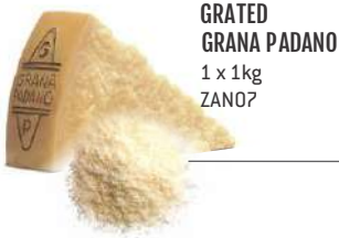
GRATED GRANA PADANO 1 x 1kg ZAN07