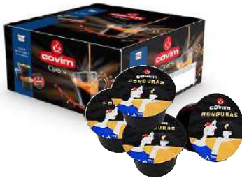
OPERA HONDURAS ARABICA 1 x 100 pods NIC5087B