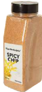
SPICY CHIP SHAKER 6 x 820g CAP195