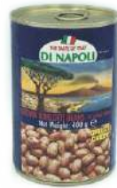
BORLOTTI BEANS 24 x 400g LBS09