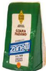
GRANA PADANO WEDGE 1 x 1kg ZAN47