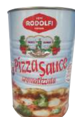
RODOLFI ARDITA PIZZA SAUCE 3 x 4.050 kg ARD01