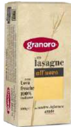
EGG LASAGNA 12 x 500g G120LAS