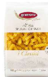
SPIRALI GRANDI FUSILLI 24 x 500g G032FUS