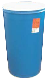
CHOPPED TOMATO 200L DRUM 1 x 210kg STER02