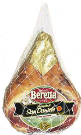
SAN DANIELE DEBONED +/-7kg BER15