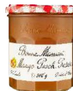
MANGO & PEACH JAM 6 x 370g WOOL2403