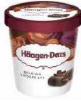
HÄAGEN-DAZS BELGIAN CHOCOLATE 8 x 460ml HD02