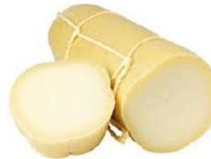
BULK PROVOLONE 1 x 3.7kg ZAN109