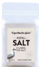
SEA SALT DOY REFILL 6 x 500g CAP105