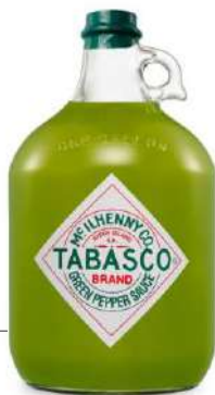
GREEN PEPPER SAUCE GALLON 4 x 3.8L TAB986