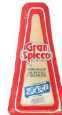
ITALIAN HARD CHEESE WEDGE 20 x 150g ZAN106