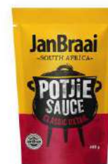
CLASSIC OXTAIL POTJIE SAUCE 10 x 400g JB09