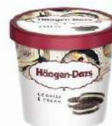
HÄAGEN-DAZS COOKIES & CREAM 24 x 100ml HD16