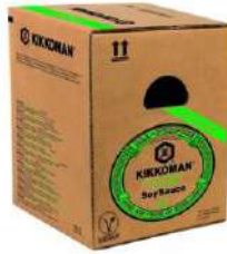
SOYA SAUCE LOW SALT BIB 1 x 20L KKE150