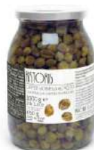
CAPERS IN VINEGAR GLASS 6 x 1000g RIST519