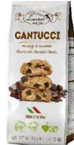
Laurieri Cantucci CHOCOLATE 15 x 200g LAU021