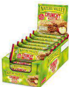
NATURE VALLEY CRUNCHY APPLE CRISP 6 x 18 x 42g NV09