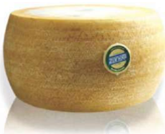
ITALIAN HARD CHEESE WHEEL 1 x +/-35kg ZAN42