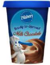
PILLSBURY ICING MILK CHOCOLATE 8 x 400g PB03