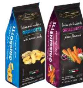
Laurieri Grissotti SESAME SEEDS 15 x 150g LAU024