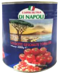
DI NAPOLI CHOPPED TOMATO 6 x 2.5kg LBS03