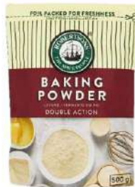
BAKING POWDER DOUBLE ACTION 12 x 500g RB001