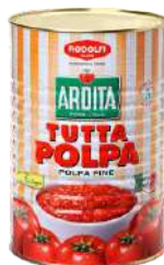
RODOLFI CHOPPED TOMATO 3 x 5 kg ROD004