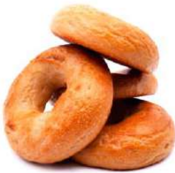
PLAIN BAGEL 50 x 100g TONY25