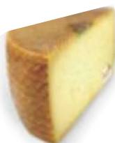
PECORINO ROMANO WEDGE 1 x 1kg TRUC87