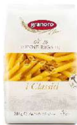
PENNE RIGATE 24 x 500g G026PEN