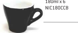
CAPPUCCINO CUP BLACK 180ml x 6 NIC180CCB