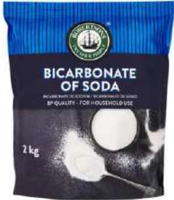
BICARBONATE OF SODA 8 x 2kg RB004