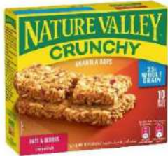
NATURE VALLEY CRUNCHY OATS BERRIES 12 x 5 x 42g NV01