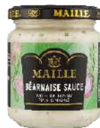
MAILLE BERNAISE SAUCE 6 x 185g MAI028