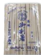
JAPANESE CHOPSTICKS DISPOSABLE NO COVER 100 JZC006