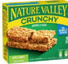
NATURE VALLEY CRUNCHY OATS HONEY 12 x 5 x 42g NV02