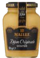
MAILLE MUSTARD DIJON 6 x 215ml MAI020