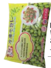
EDAMAME FROZEN WITHOUT SHELL 20 x 454g JF513