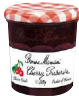
CHERRY JAM 6 x 370g WOOL296