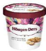
HÄAGEN-DAZS MACADAMIA NUT BRITTLE 24 x 100ml HD13