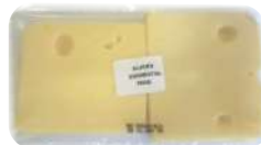
EMMENTAL SLICES 10 x 400g ZAN352