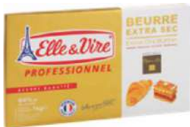
EXTRA DRY UNSALTED BUTTER 10 x 1kg ELVIR01