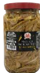
ANCHOVY PIECES IN SUNFLOWER OIL (LA MONAGASQUE) 4 x 1.7kg RUS009