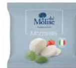
MOZZARELLA FIOR DI LATTE 20 x 100g DAL005