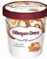
HÄAGEN-DAZS SALTED CARAMEL 8 x 460ml HD08