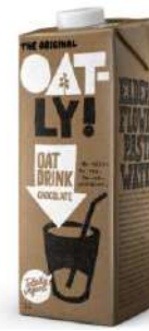
OATLY OAT DRINK CHOCOLATE 6 x 1L OAT583