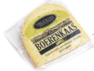
BOERENKAAS WITH CUMIN +/-200g TRUC55