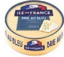
BRIE BLEU 12 x 125g BON4301