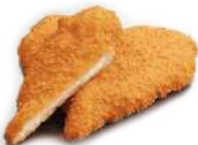
CHICKEN SCHNITZEL 1 x 5kg FIN02