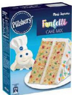
PILLSBURY MIX FUNFETTI RAINBOW 6 x 425g PB09