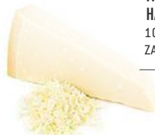
GRATED ITALIAN HARD CHEESE 10 x 1kg ZAN52