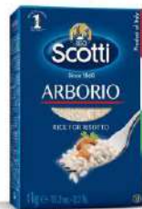
RISO SCOTTI RICE ARBORIO 10 x 1kg SC008