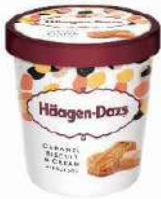
HÄAGEN-DAZS CARAMEL BISCUIT & CREAM 8 x 460ml HD07