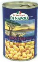
CHICK PEAS 24 x 400g LBS08