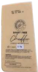
VEGAN CHEDDAR 1 x 1kg VEG15