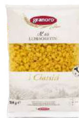
LUMACHETTE 24 x 500g G066LUM