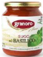
BASIL PASTA SAUCE 6 x 370g GR01BAS