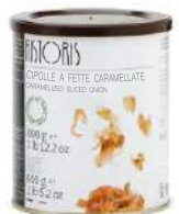
ONIONS SLICED CARAMELIZED 6 x 800g RIST028