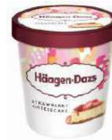
HÄAGEN-DAZS STRAWBERRY CHEESECAKE 8 x 460ml HD06