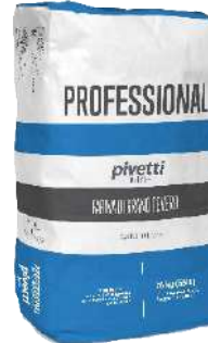
MP TIPO 00 PIZZA FLOUR 1 x 25kg MOLI057