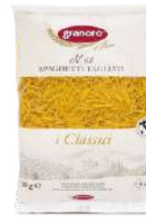
TAGLIATI 24x500g G1068