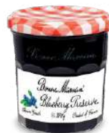
BLUEBERRY JAM 6 x 370g WOOL379