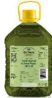
BLENDED SUNFLOWER & EXTRA VIRGIN OLIVE OIL 2 x 5L OLI10