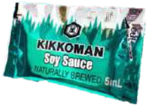
SOYA SAUCE BARAN SACHET 14 x 5ml JS147