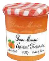
APRICOT JAM 6 x 370g WOOL293