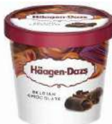
HÄAGEN-DAZS BELGIAN CHOCOLATE 24 x 100ml HD15