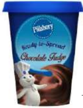
PILLSBURY ICING CHOCOLATE FUDGE 8 x 400g PB01